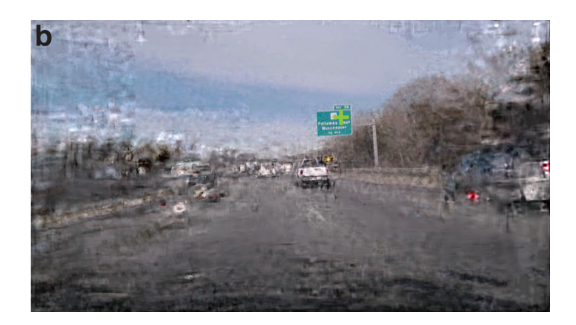
Figure 3. Peripheral vision in driving, as visualized here with the texture tiling model (Balas et al., 2009), is sufficient to guide search for specific information. The green cross in each panel indicates the fixation location. The magenta arrow in (a) indicates an eye movement planned to the sign, which remains visible but not readable in the periphery. Note how the visualization changes in (b) when the fixation location shifts. Sufficient information is available in (a) to enable an accurate eye movement to the sign.

the visual field, and understanding what drivers can and cannot learn from it is essential if we are to understand how drivers acquire information about the world and how the limitations of the visual system constrain and enable their ability to do so.