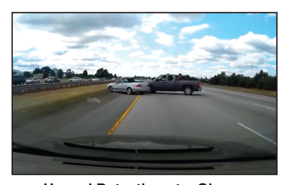
Hazard Detection at a Glance Hazards detected in video with 220 ms stimulus duration

Images and Results from Wolfe et.al, 2019