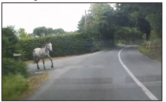
Hazard Detection and Localization Hazards localized in video with 400 ms stimulus duration

Images and Results from Wolfe et.al, 2019