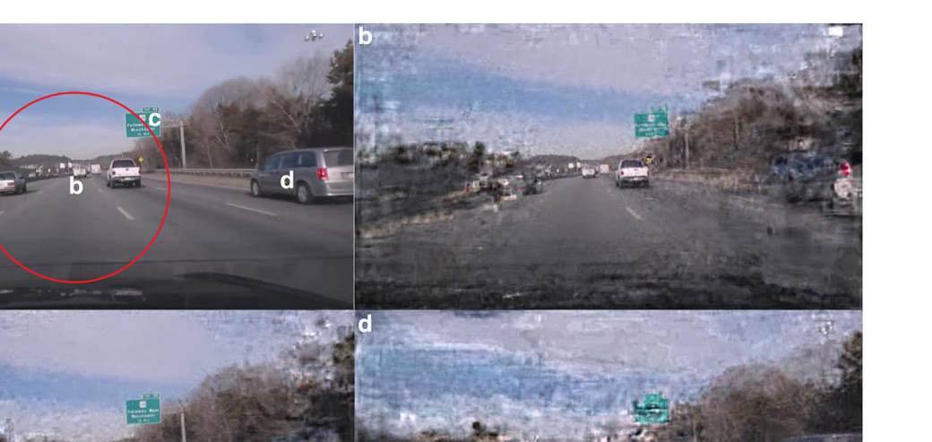
Fig. 3. Visualizing the information available in peripheral vision depending on fixation location. (a) An unmodified photograph of a highway scene near Boston, MA with an exit sign. The red circle around the letter b in the panel visualizes a 15° radial Useful Field of view. The letters b, c and d overlaid on the image indicate different fixation locations used for the visualizations in subsequent panels. (b) Photograph from (a), with the point of fixation on the forward roadway ahead of the vehicle, after being processed through the Texture Tiling model to visualize how peripheral information might be represented. Notice the degree to which the scene remains generally recognizable, and how the visualization changes with increased eccentricity from the leading vehicle. Also, note that the region corresponding to the Useful Field (as shown in (a)) is not left inviolate by this transformation. In particular, the exit sign remains recognizable, and the positions of other vehicles remains fairly stable, although some details are lost. (c) Photograph from (a), visualized with the point of fixation on the exit sign; notice that vehicles in the left lane are somewhat obscured, but detectable. There are considerable cues for lane-keeping, including the left road edge, which lies far from the point of gaze. (d) Photograph from (a), visualized with the point of fixation on the van in the far right lane. The exit sign is still visible, but the left lanes of travel are nearly unrecognizable, predicting suboptimal performance localizing nearby vehicles. (For interpretation of the references to colour in this figure legend, the reader is referred to the web version of this article.)

(Helmholtz, 1898, translated 1924; James, 1890)). The presumed role of attention in vision (and what, in vision, can be accomplished without it), has evolved as a result of over a century of research (see (Carrasco, 2011) for a modern review of recent work).